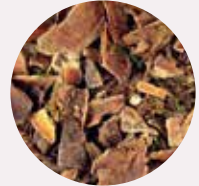
Cascara Sagrada Bark